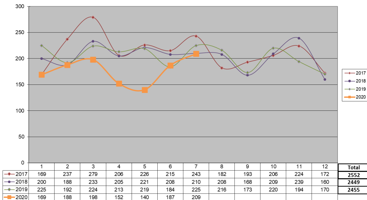
Planning and discharge of condition applications received

Planning applications have recovered quickly, June / July 2020 figures almost mirror June / July 2019 figures.